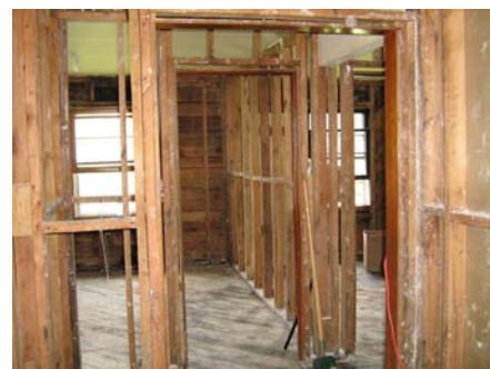
Stripped to studs and sub-floor.